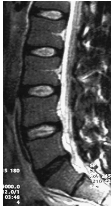
Fig. 13.2 Sagittal T2-weighted magnetic resonance image of the lumbar spine demonstrating an L5–S1 “black disc.”

LBP is the second most common reason that patients seek medical attention and is the fifth most common reason for